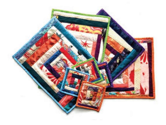
Textile art by Tamara Russell

Book online from Tuesday 1 April at www.gleneira.vic.gov.au/gallery-programs