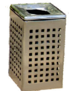
④. Remove and replace stainless steel bin