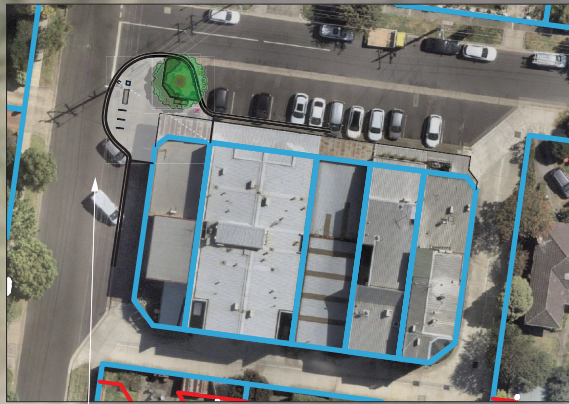
Enlarged area / focus of works