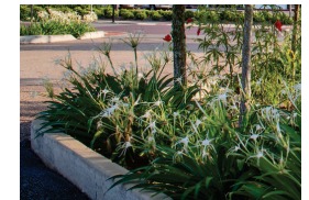
③. New garden bed within footpath