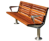
②. New bench seats