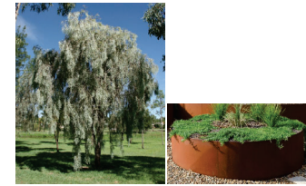
①. Acacia pendula "Weeping Myall" & raised planter