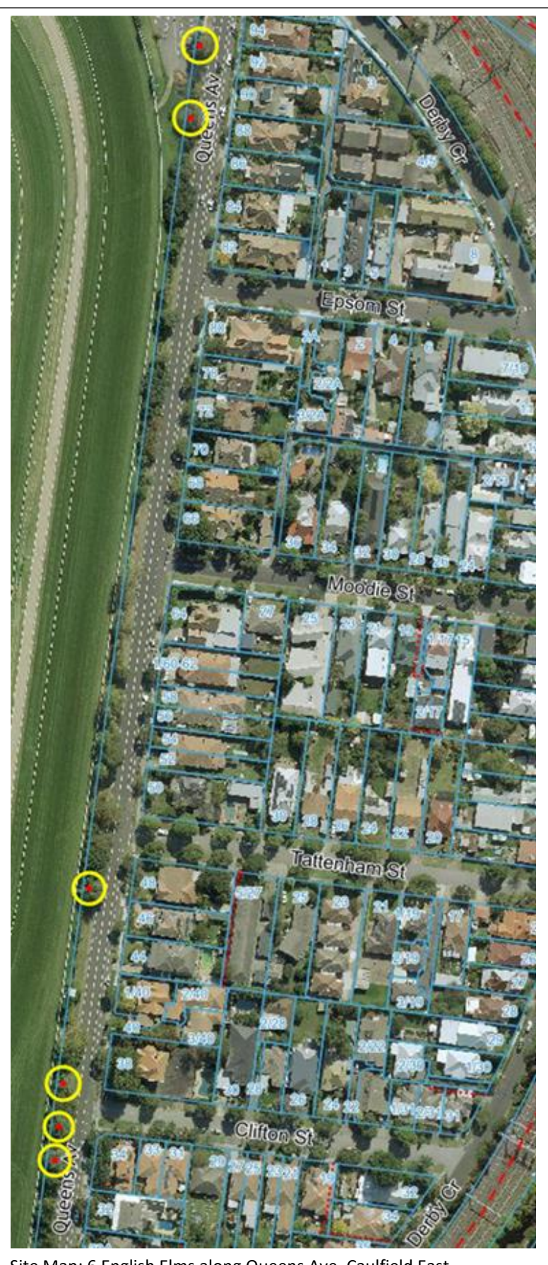
Site Map: 6 English Elms along Queens Ave, Caulfield East