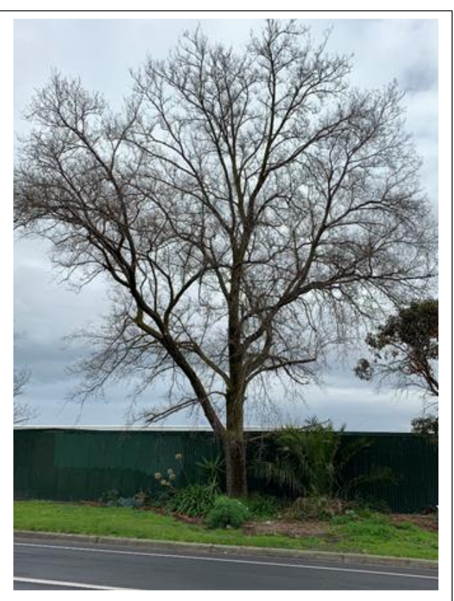
Tree 2 - TS10522