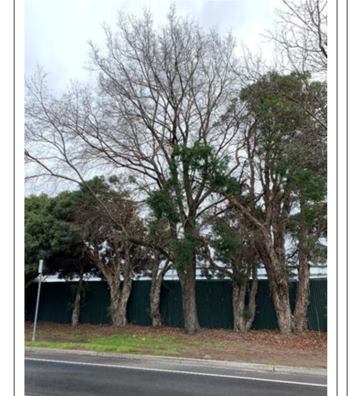
Tree 5 - TS10417