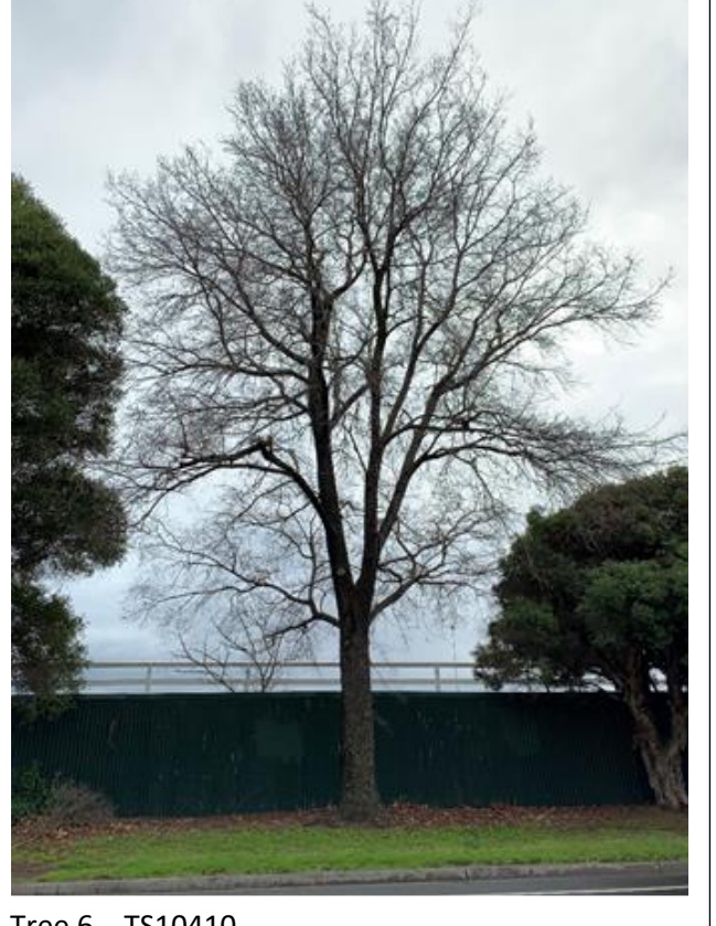
Tree 6 - TS10410