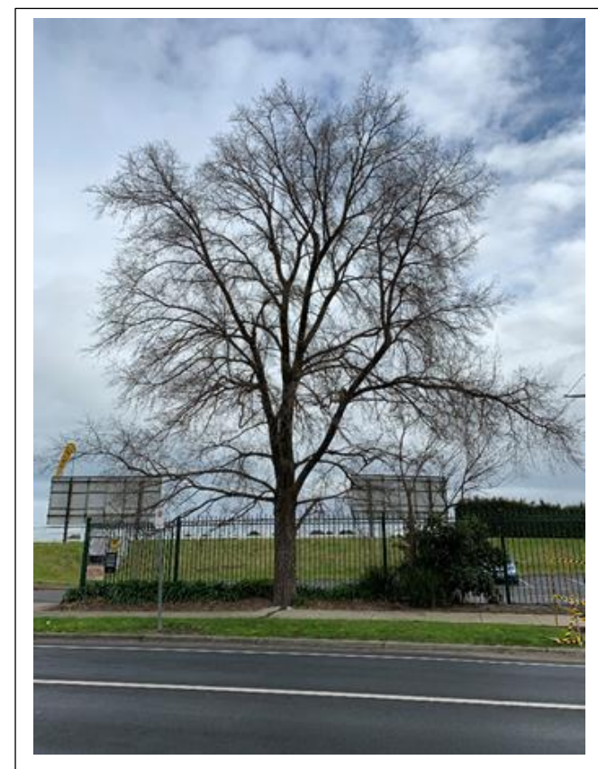
Tree 1 – TS10525

These trees stand out amongst the mixed vegetation within this street reserve and provide substantial canopy coverage for the area, making a major contribution to the local landscape and providing amenity to the community. As variegated specimens, with the distinctive white mottling on their leaves, they are particularly noticeable and important to the neighbourhood character.