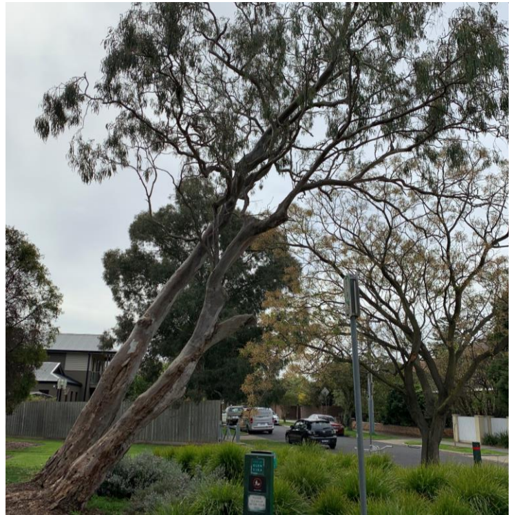
The tree has a significant leaning growth habit