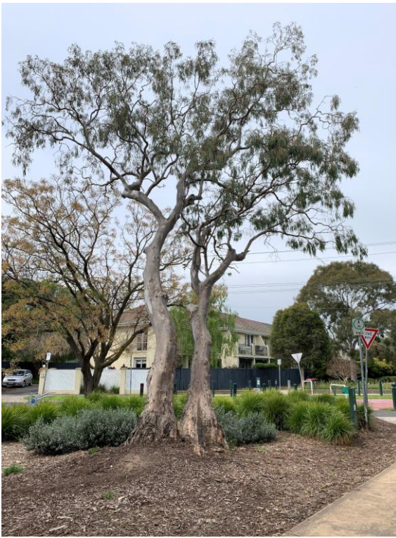
The tree has parallel twin trunks