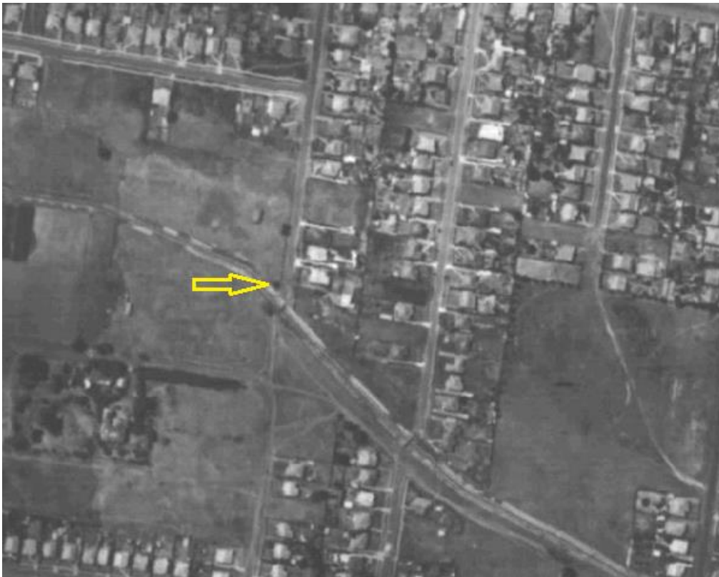
The tree is identifiable from aerial photographs from 1945