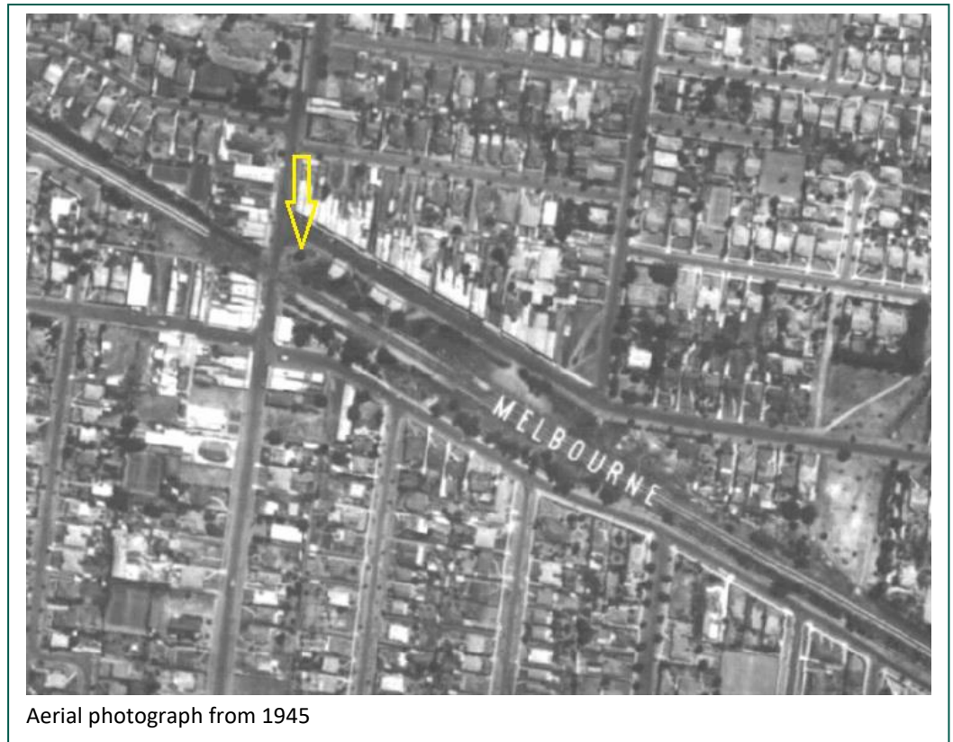
Aerial photograph from 1945