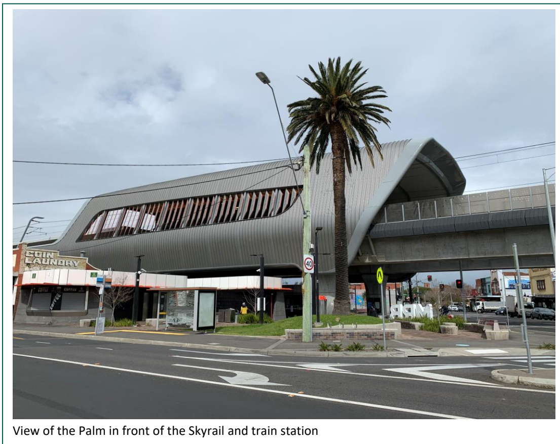
View of the Palm in front of the Skyrail and train station