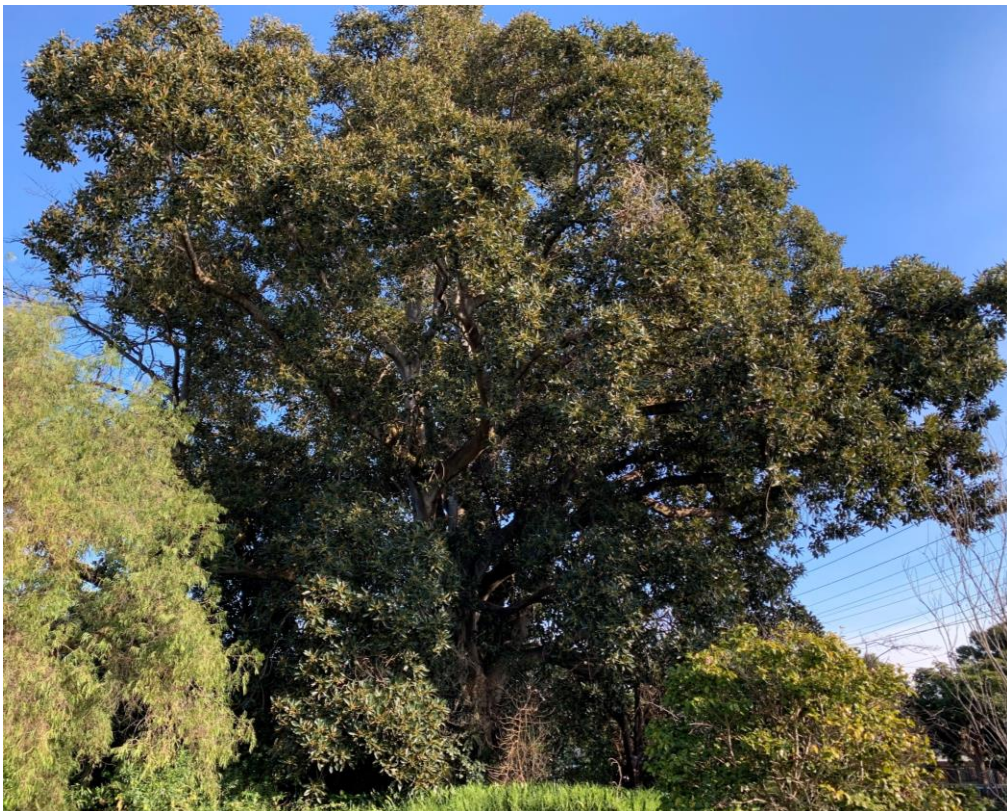
View of the tree from inside the homestead garden