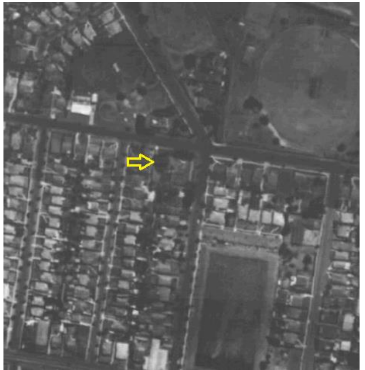
Aerial photograph from 1945