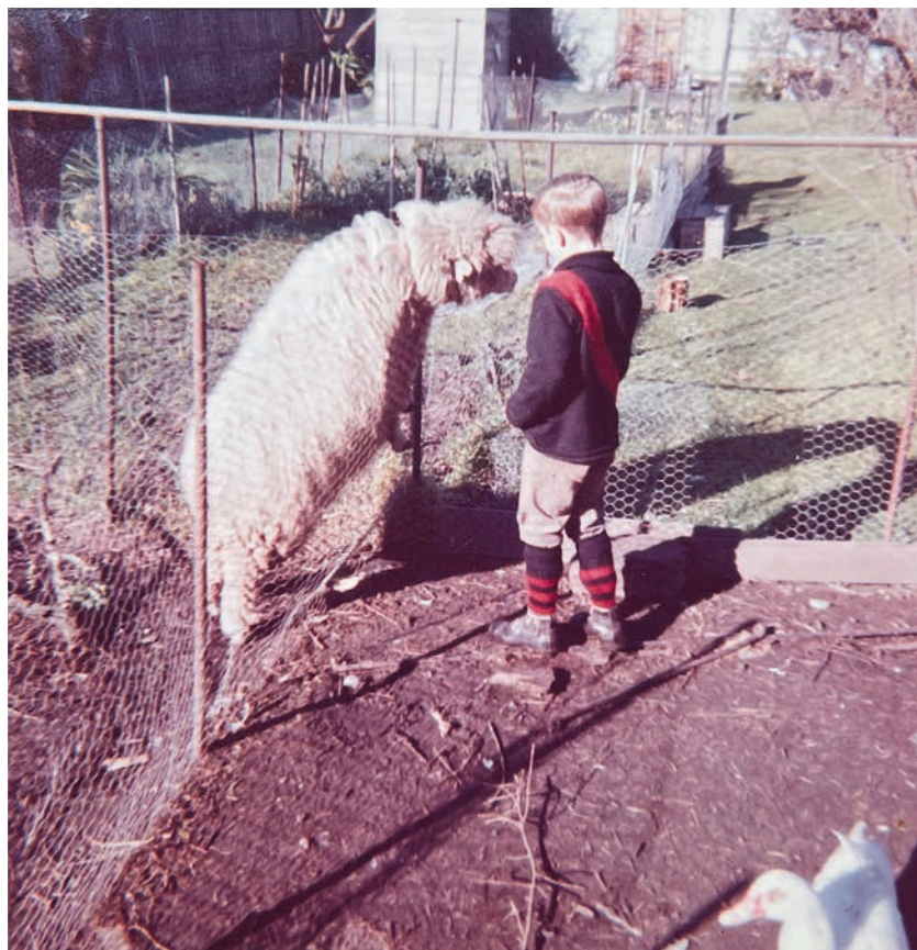
Backyard, Garden Avenue, Glen Huntly c.1960s.

Bookings available from Tuesday 1 September at www.gleneira.vic.gov.au/gallery-programs