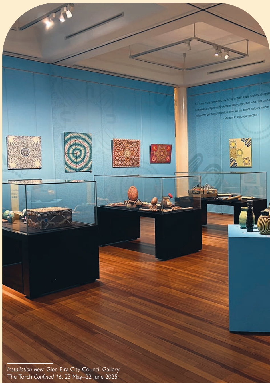
Installation view: Glen Eira City Council Gallery. The Torch Confined 16. 23 May–22 June 2025.