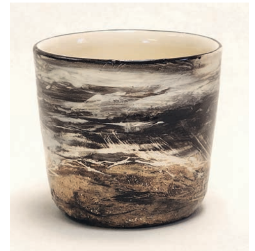
Dominique Dunstan Storm on a teacup, 2025 Slip painting and sgraffito on earthenware 9 x 8 x 8 cm

The paintings capture skies seen above local streets and parks. The handmade ceramics, created at Moorleigh Ceramic Cooperative, are inspired by the long tradition of tea — a ritual that brings peace, friendship, and comfort.