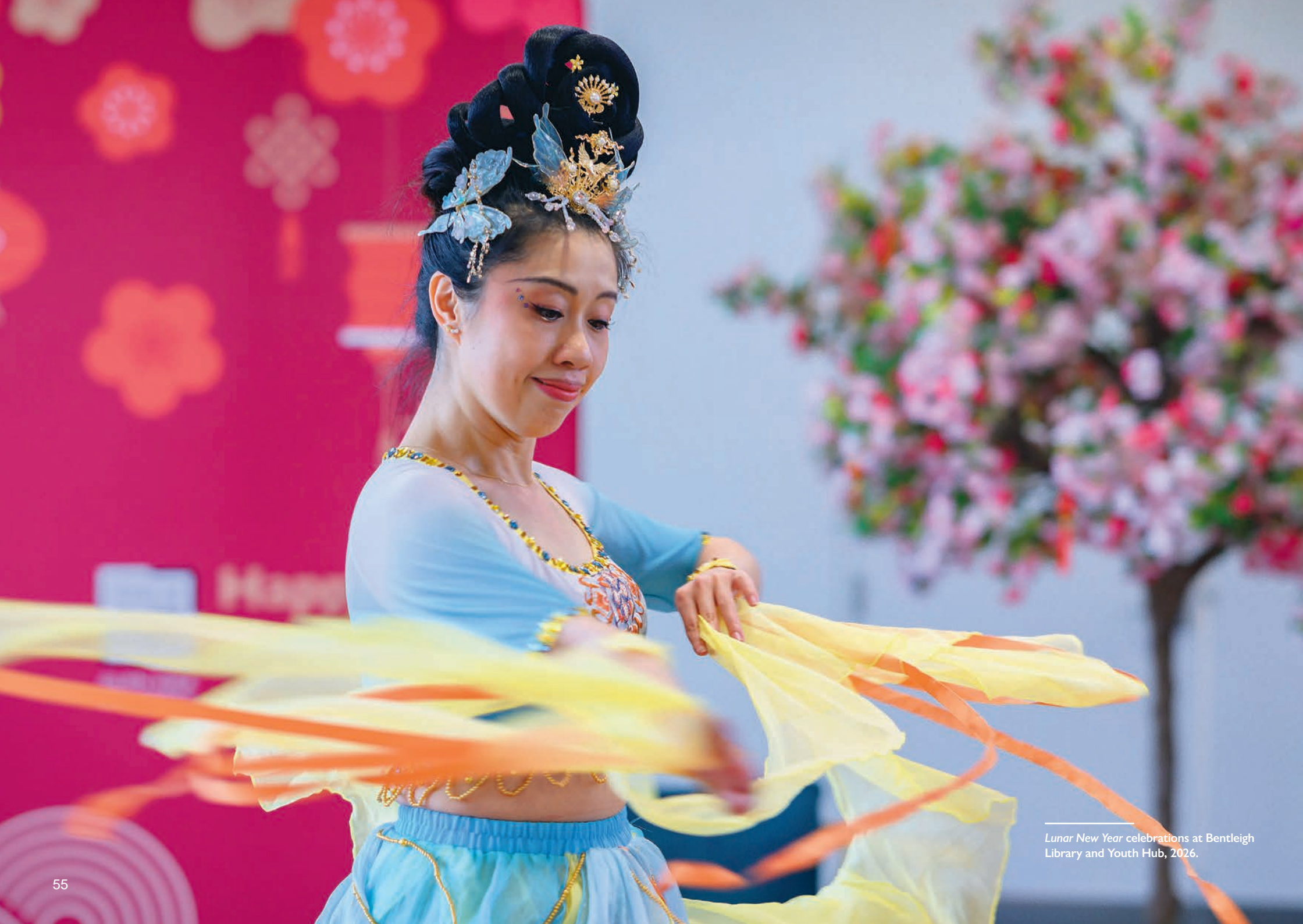
Lunar New Year celebrations at Bentleigh Library and Youth Hub, 2026.