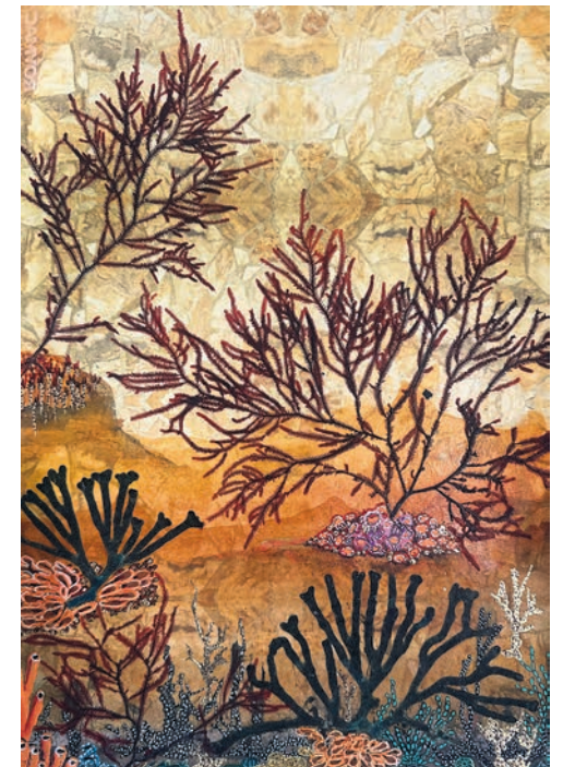
Bridget McDermott Substrate and Drift , 2026 Pressed seaweed, watercolour, pen, gold leaf 42 x 29 cm

The exhibition challenges traditional notions of the female artist, reclaiming practices such as collecting and preserving as important acts of cultural, ecological and feminist expression.