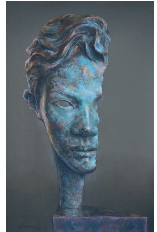
Luke Zhai Bronze Self-portrait 2022 Pastel on paper 70 x 50 cm

Through a series of paintings, Luke explores themes of flow, path and connection, moving from realistic imagery to more symbolic and expressive forms.