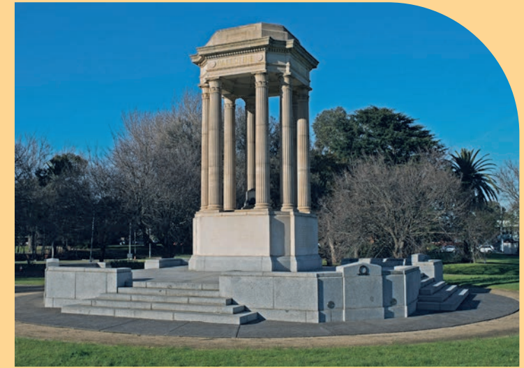
Caulfield Park Cenotaph.