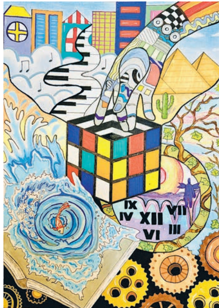
Chloe Shen The Magical Journey of Time and Space , 2025 Paint pens, coloured pencils, alcohol brush pens and soft pastels 37.3 x 26.3 cm