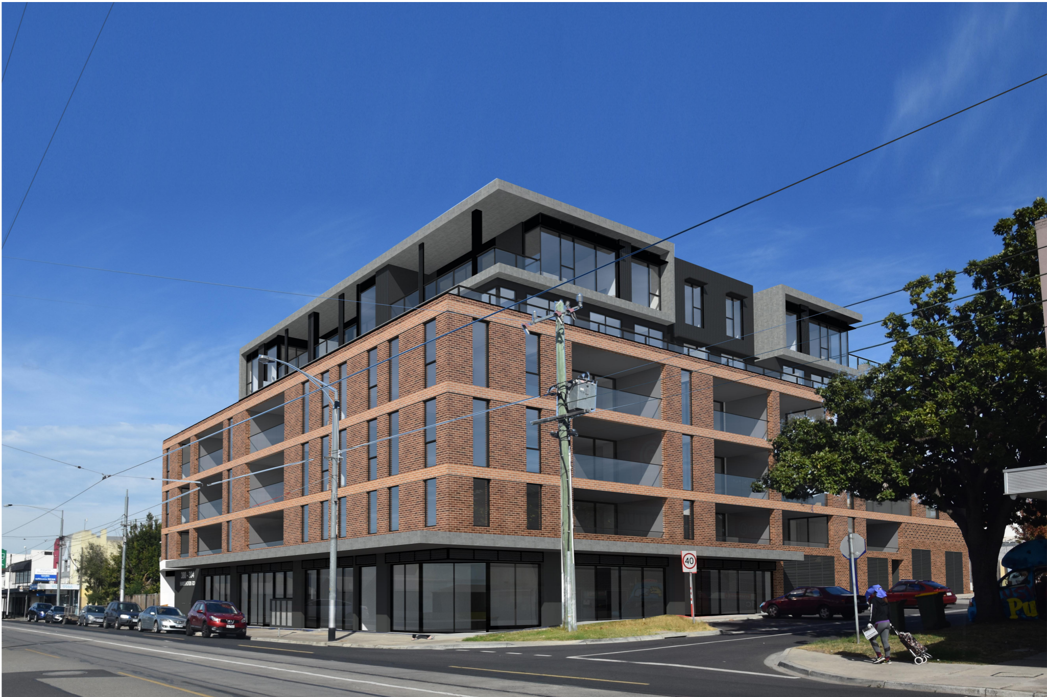
VIEW OF PROPOSED DEVELOPMENT FROM HAWTHORN RD LOOKING SOUTH