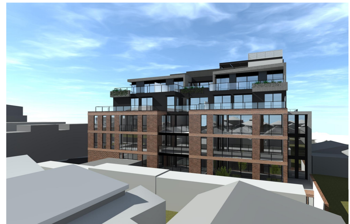
VIEW OF WEST ELEVATION OF PROPOSED DEVELOPMENT