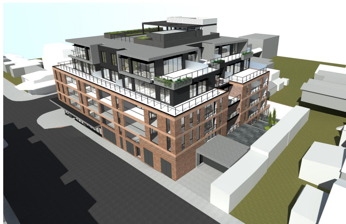
VIEW OF NORTH-WEST CORNER OF PROPOSED DEVELOPMENT