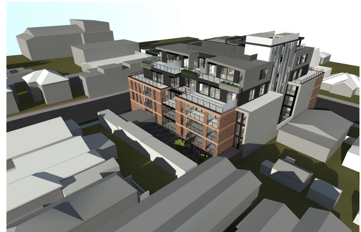
VIEW OF SOUTH-WEST CORNER OF PROPOSED DEVELOPMENT