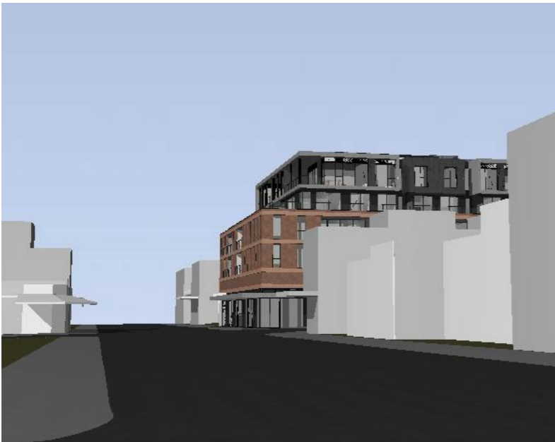
VIEW FROM DIGITAL 3D MODEL OF ENDORSED PLANS