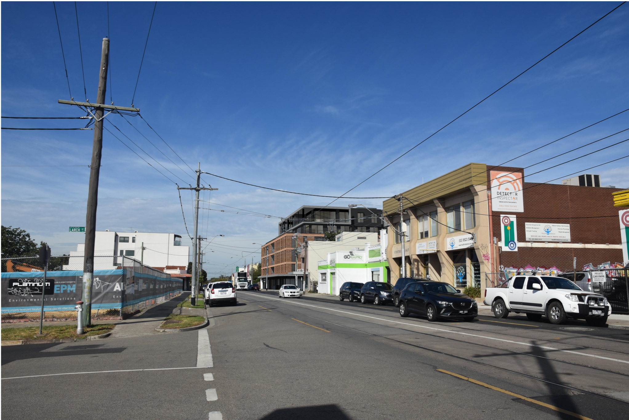
VIEW OF PROPOSED DEVELOPMENT FROM HAWTHORN RD LOOKING SOUTH