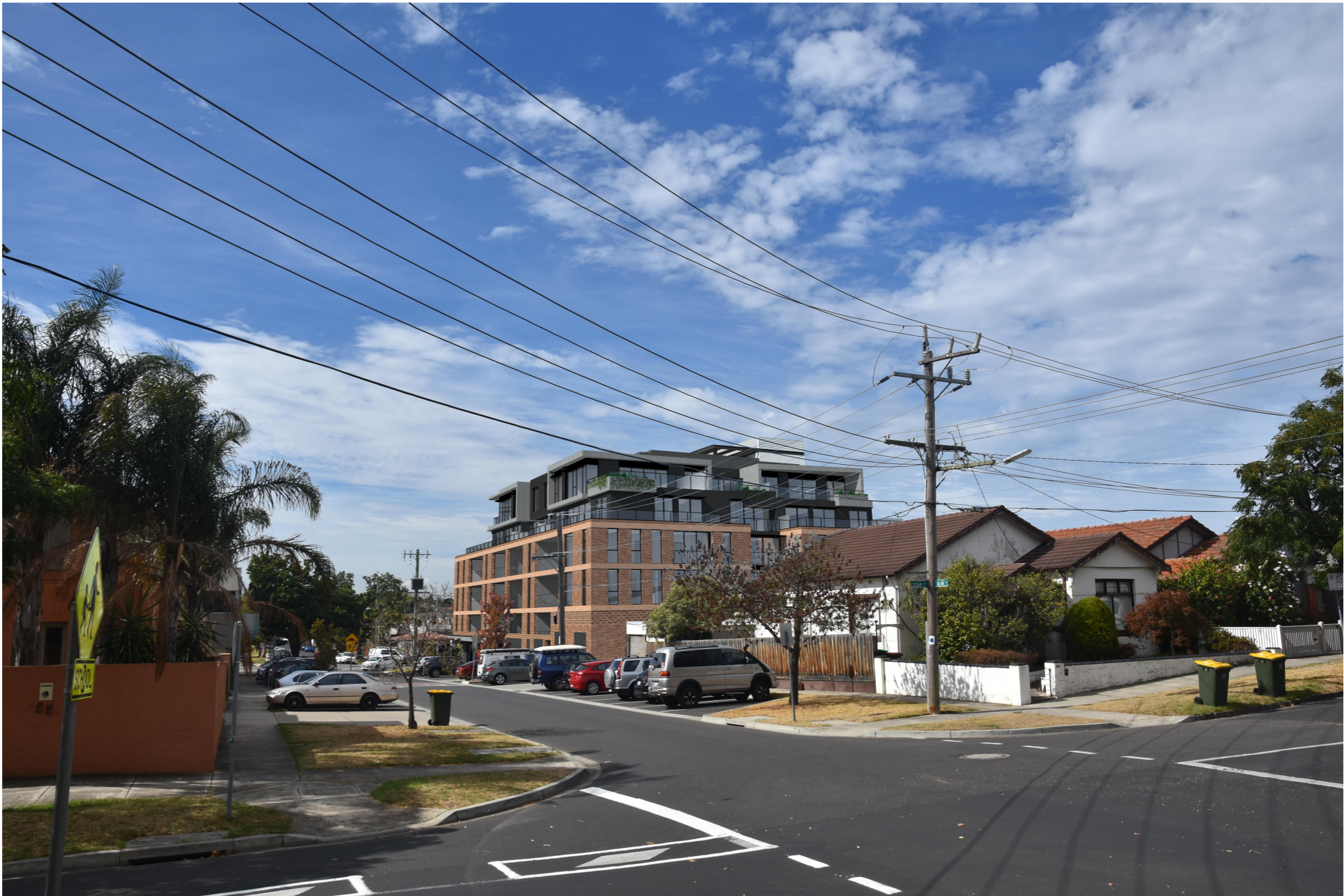
VIEW OF PROPOSED DEVELOPMENT FROM OLIVE ST LOOKING SOUTH-EAST (FROM INTERSECTION OF OLIVE ST & CEDAR ST)