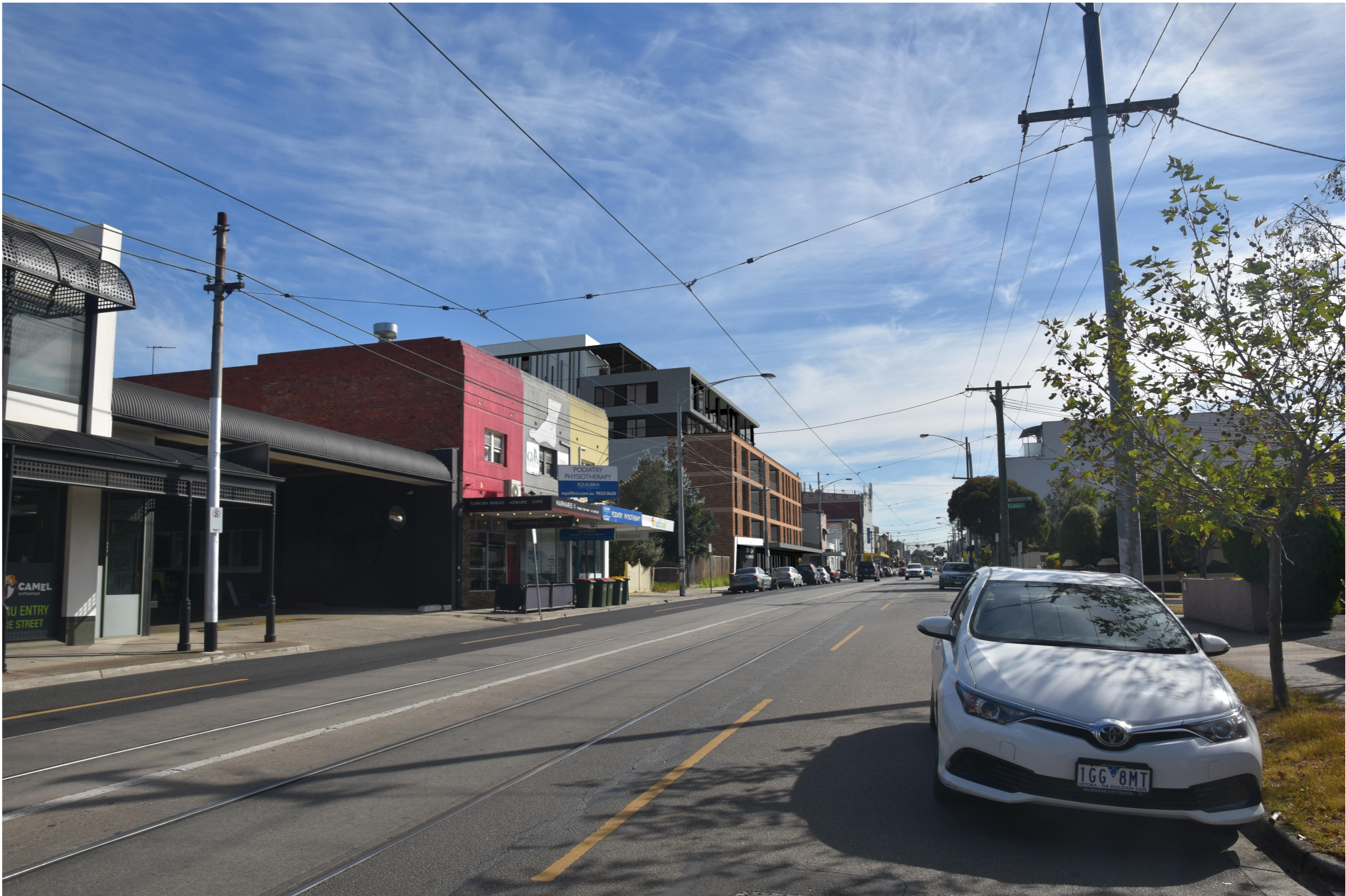
VIEW OF PROPOSED DEVELOPMENT FROM HAWTHORN RD LOOKING NORTH