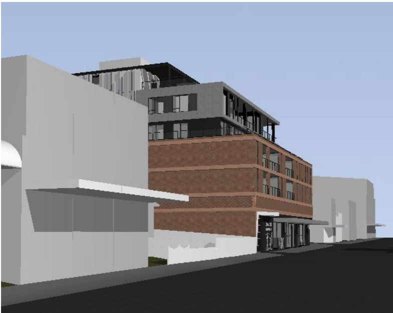
VIEW FROM DIGITAL 3D MODEL OF ENDORSED PLANS