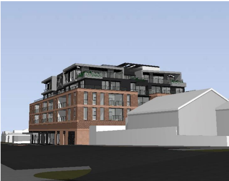
VIEW FROM DIGITAL 3D MODEL OF ENDORSED PLANS