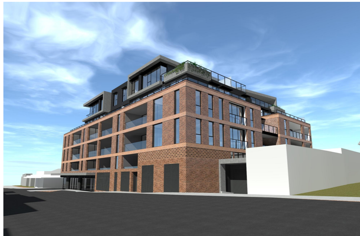
VIEW OF PROPOSED DEVELOPMENT FROM OLIVE ST LOOKING SOUTH-EAST