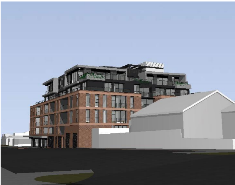
VIEW FROM DIGITAL 3D MODEL OF AMENDED PLANS