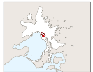
Part of Planning Scheme Map 3HO

Disclaimer This publication may be of assistance to you but the State of Victoria and its employees do not guarantee that the publication is without flaw of any kind or is wholly appropriate for your particular purposes and therefore disclaims all liability for any error, loss or other consequence which may arise from you relying on any information in this publication.