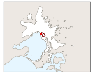
Part of Planning Scheme Map 1HO

Disclaimer This publication may be of assistance to you but the State of Victoria and its employees do not guarantee that the publication is without flaw of any kind or is wholly appropriate for your particular purposes and therefore disclaims all liability for any error, loss or other consequence which may arise from you relying on any information in this publication.