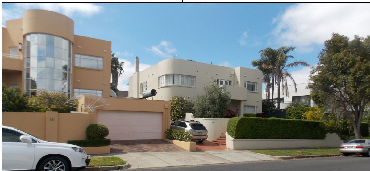
Photograph by Built Heritage Pty Ltd, October 2019