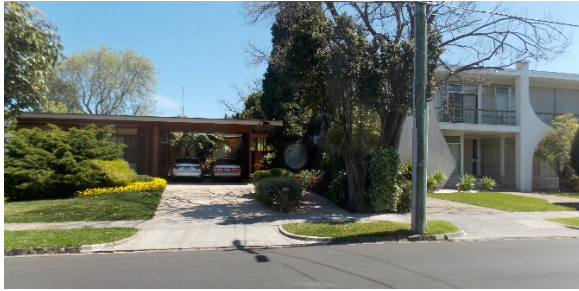
Photograph by Built Heritage Pty Ltd, October 2019