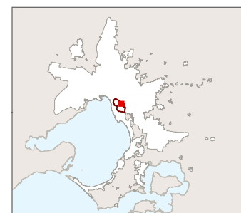
Part of Planning Scheme Map 2DDO

Disclaimer This publication may be of assistance to you but the State of Victoria and its employees do not guarantee that the publication is without flaw of any kind or is wholly appropriate for your particular purposes and therefore disclaims all liability for any error, loss or other consequence which may arise from you relying on any information in this publication.