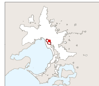
Part of Planning Scheme Map 2DDO

Disclaimer This publication may be of assistance to you but the State of Victoria and its employees do not guarantee that the publication is without flaw of any kind or is wholly appropriate for your particular purposes and therefore disclaims all liability for any error, loss or other consequence which may arise from you relying on any information in this publication.