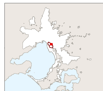
Part of Planning Scheme Map 2

Disclaimer This publication may be of assistance to you but the State of Victoria and its employees do not guarantee that the publication is without flaw of any kind or is wholly appropriate for your particular purposes and therefore disclaims all liability for any error, loss or other consequence which may arise from you relying on any information in this publication.