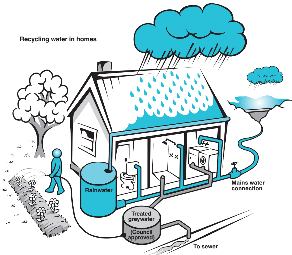
Recycling water in homes

Prior to planning a greywater treatment system, you need to obtain advice from a licensed plumber, the Department of Health and the Environment Protection Authority. A permit from Council is required.