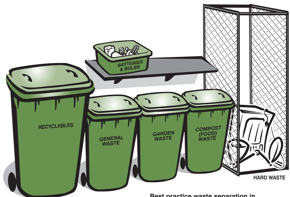
Best practice waste separation in multi-unit residential developments.

Construction sites can represent a great burden on local waterways. Site litter, paint, solvents, bricks, cleaning substances and clean-fill can all contaminate stormwater runoff. It is an offence under the Environment Protection Act to discharge contaminated water into the stormwater system. To avoid contamination, ensure that a drainage system is installed before construction activities commence and storm water is diverted from areas where soil is exposed.