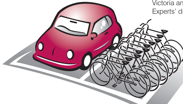
One car space can usually be converted to 10 to 14 bike parking spaces.

In recent years, the bicycle industry has developed a wide range of parking solutions addressing product selection criteria, such as space availability, user preferences and security requirements. The table below provides an overview of the most common bicycle parking systems. For further details, we recommend referring to the 'Bicycle Parking Handbook' from Bicycle Network Victoria and talking to their 'Bike Parking Experts' division