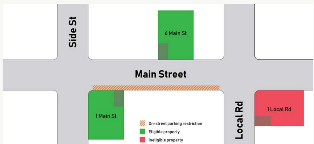
Eligible property diagram.