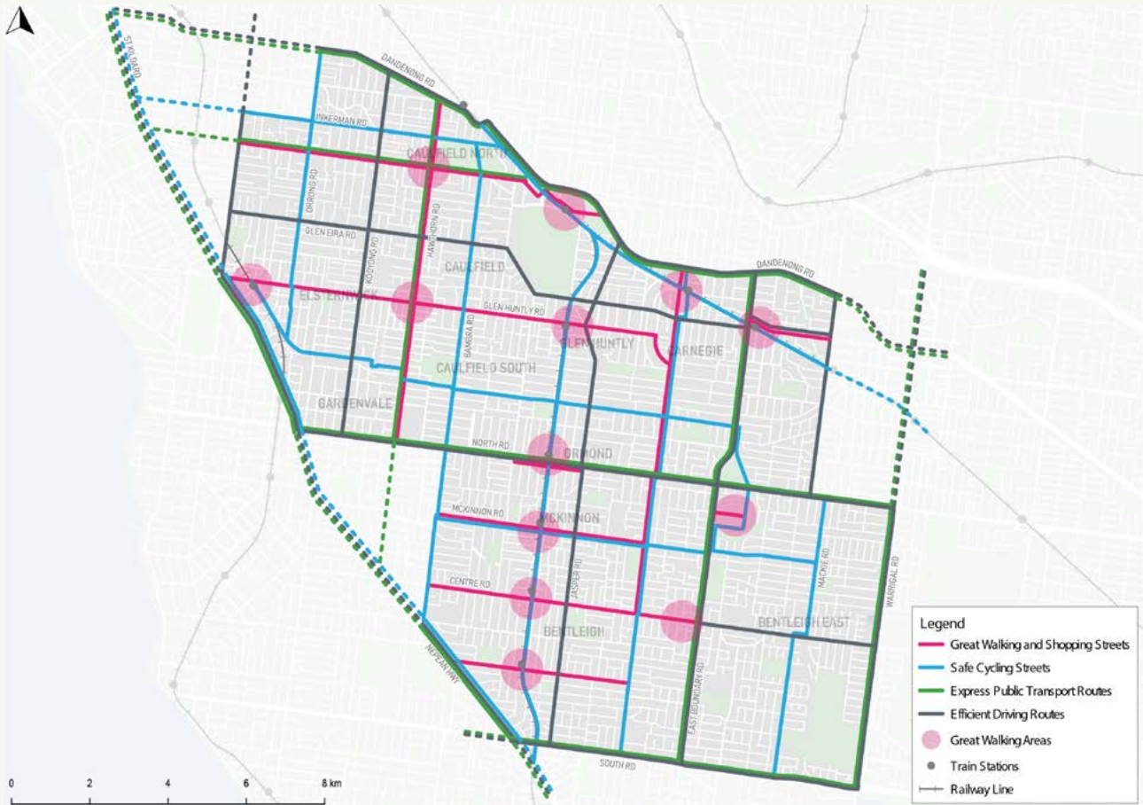
Parking Permits Corridor Map.