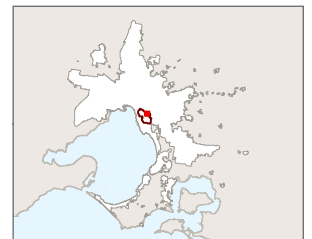
Part of Planning Scheme Map 2HO

Disclaimer This publication may be of assistance to you but the State of Victoria and its employees do not guarantee that the publication is without flaw of any kind or is wholly appropriate for your particular purposes and therefore disclaims all liability for any error, loss or other consequence which may arise from you relying on any information in this publication.