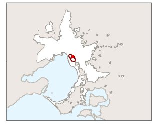
Part of Planning Scheme Map 2HO

Disclaimer This publication may be of assistance to you but the State of Victoria and its employees do not guarantee that the publication is without flaw of any kind or is wholly appropriate for your particular purposes and therefore disclaims all liability for any error, loss or other consequence which may arise from you relying on any information in this publication.