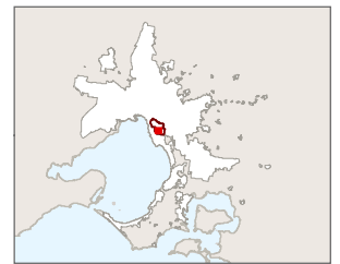
Part of Planning Scheme Map 3NCO