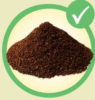
Coffee grounds and loose leaf tea