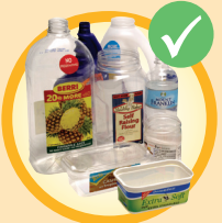
Plastic bottles and containers (empty and lids separated)