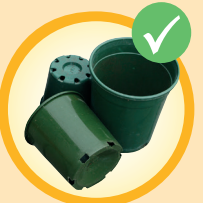
Plastic pots (less than 10cm in diameter)