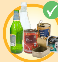
Empty glass bottles and jars (with lids separated), cans and aerosols