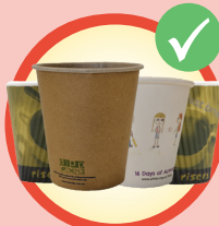
All coffee cups (lids can be recycled)