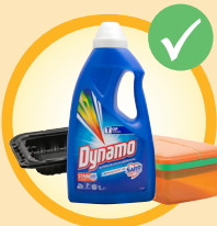
Hard plastic items