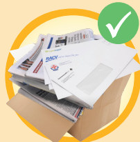
Cardboard, paper, newspaper and envelopes