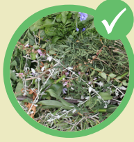
Weeds, flowers, grass, leaves and garden prunings