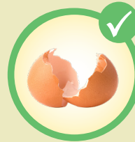
Dairy leftovers and egg shells