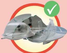
Ceramics, crockery and glassware