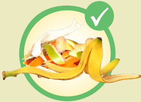
Fruit and vegetable scraps