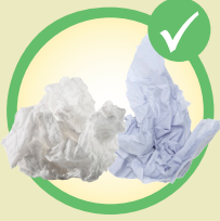
Used paper towel and tissues