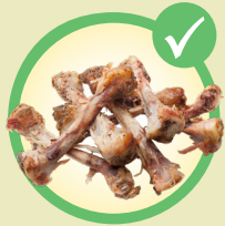
Meat scraps and bones (including seafood)