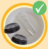
Plastic cutlery, paper plates and coffee cup lids