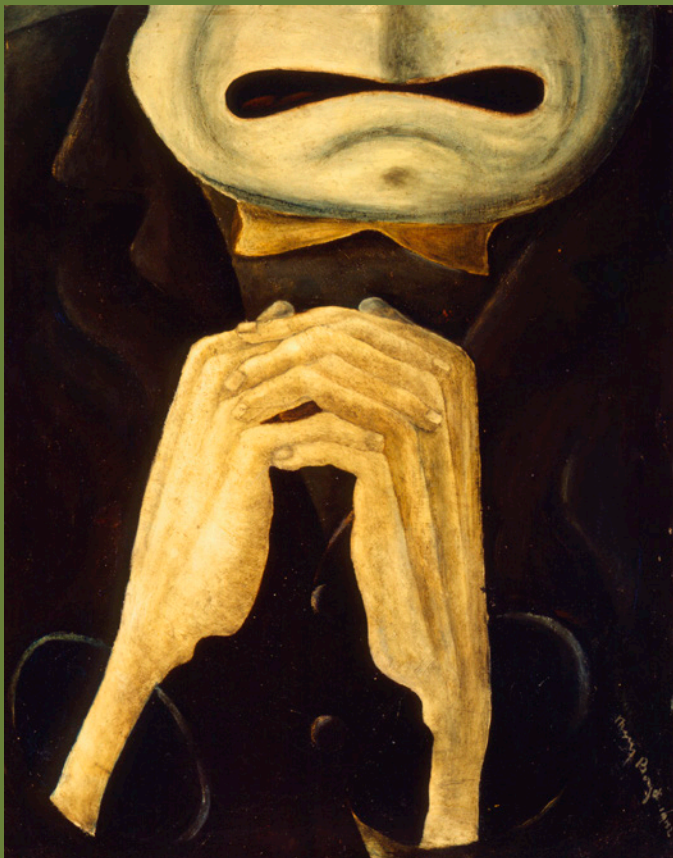
Front cover image: Emma Minnie Boyd Afternoon Tea (detail) 1888 Oil on canvas 41 x 35.8 cm Purchased 1888 Collection Bendigo Art Gallery 1888.1 Boyd Women exhibition