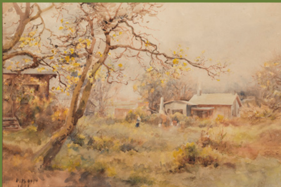
Top: Emma Minnie Boyd Open Country 1921 Watercolour on paper Bundanon Trust Collection