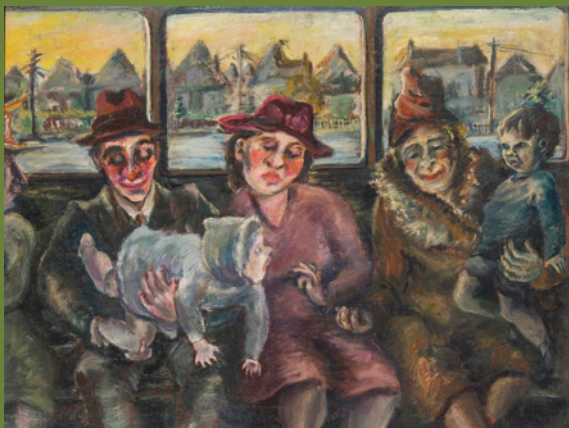
Above: Yvonne Boyd Melbourne Tram 1944 Oil on muslin on cardboard Bundanon Trust Collection © Reproduced with permission of the Boyd Family