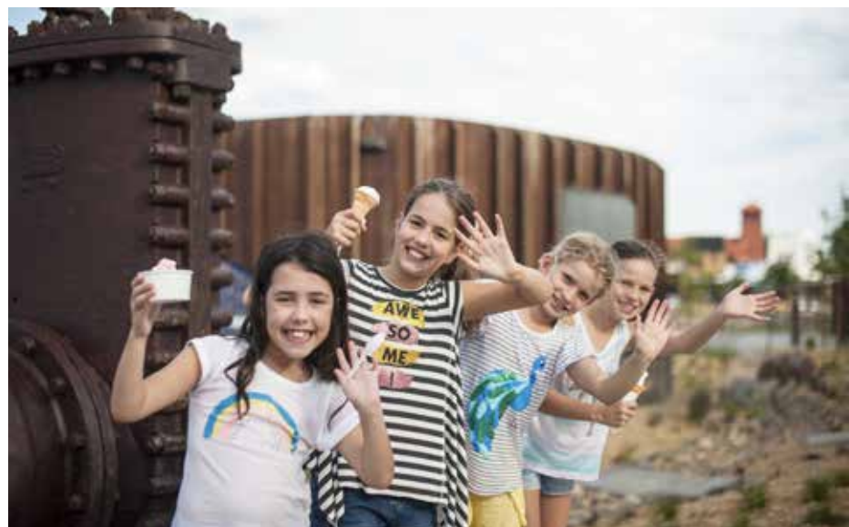
Booran Reserve was the perfect destination for some school holiday fun.