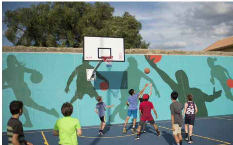
The active sports area, which includes half-court basketball, is a popular attraction at Glen Eira’s newest park.