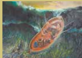
Phil Kreveld The Voyage 2015 Shellac, ink, acrylic, egg tempera and oil on Belgian linen 180 x 250 cm

Floor talk by artist Phil Kreveld Friday 28 July, 12.30pm Glen Eira City Council Gallery Free admission