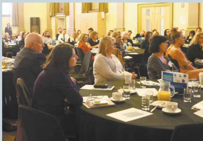
The Schools Focused Youth Services Resilience Survey Project Breakfast Forum was held earlier this year. Attendees heard about the benefits of using the Survey.

This will add to the 160,000 young people in more than 800 schools across Australia who have taken part in the Resilience Youth Survey .