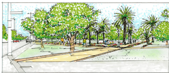
Hawthorn-Inkerman Rds. Entry.

Problem / Opportunity: Existing cooking facilities are used intensively by both large and small groups. Presently, the great majority of electric BBQ's are located adjacent to a playground at the eastern end of the park. This congregation of one type of facility in one location limits the range of choices for park patrons. Recommendation: Existing eastern facilities to be upgraded in conjunction with playground. Create a second picnic/playground west of Council depot that will offer an alternative facility for smaller groups and meet the needs of people watching events on the main oval.