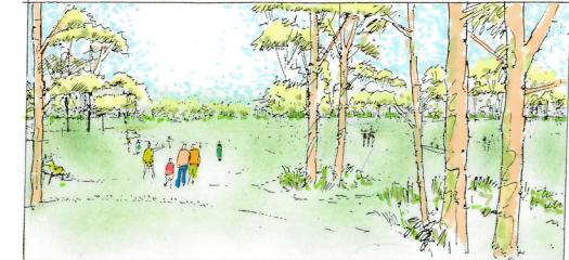
Ovals ringed by Native Trees.