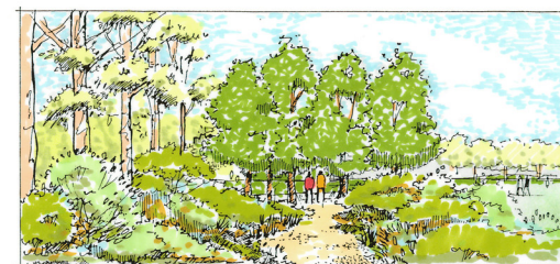
New Native Garden (The Old Aviary)