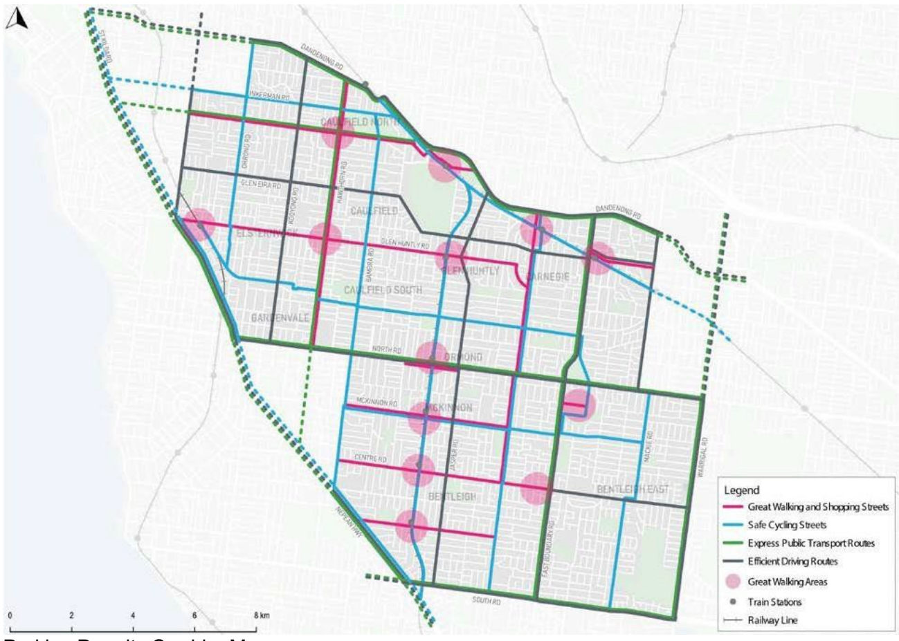
Parking Permits Corridor Map.