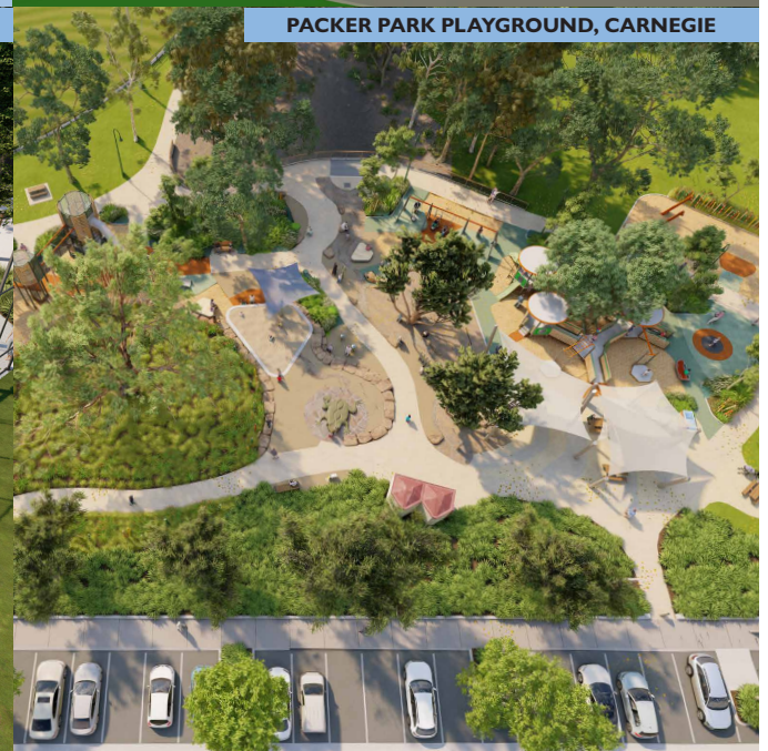
PACKER PARK PLAYGROUND, CARNEGIE