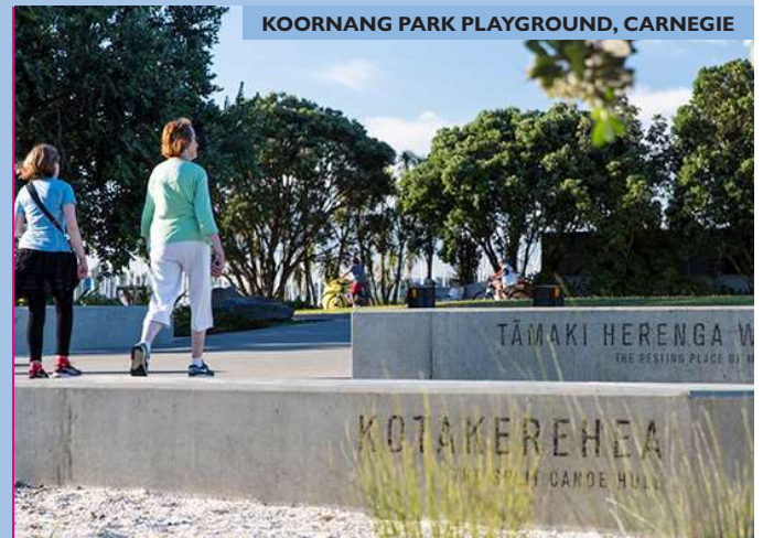
KOORNANG PARK PLAYGROUND, CARNEGIE

This funding will enable Council to improve the quantity and quality of public open space for our residents; develop, improve and maintain the amenity of our public places; and provide improved access to a mix of passive and active spaces that are inclusive, fit-for-purpose, and flexible to meet the needs of our diverse community.