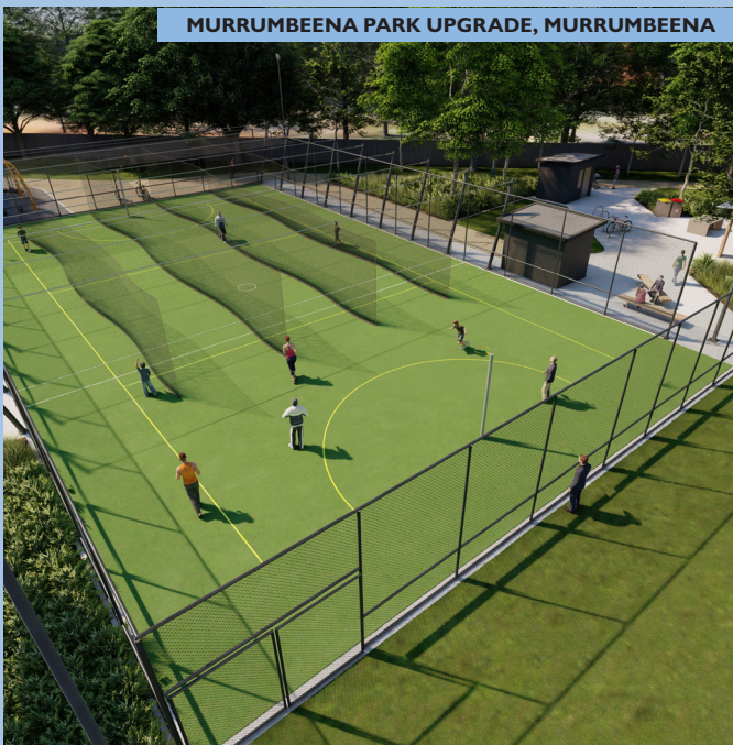
MURRUMBEENA PARK UPGRADE, MURRUMBEENA