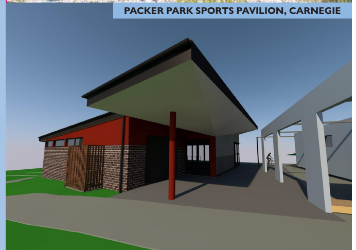
PACKER PARK SPORTS PAVILION, CARNEGIE