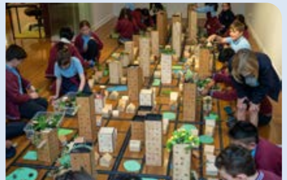
Sustainability activities at Glen Eira Gallery