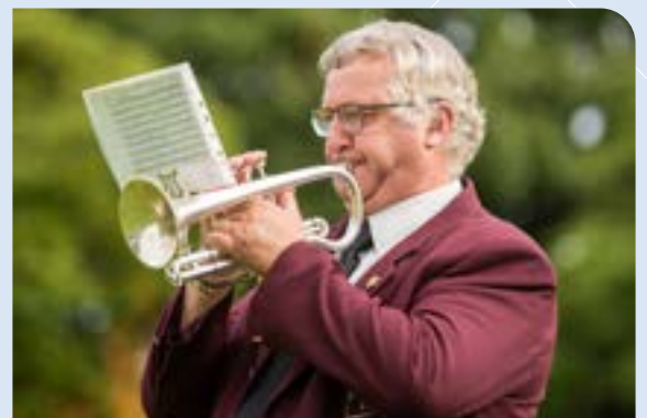
Glen Eira City Band