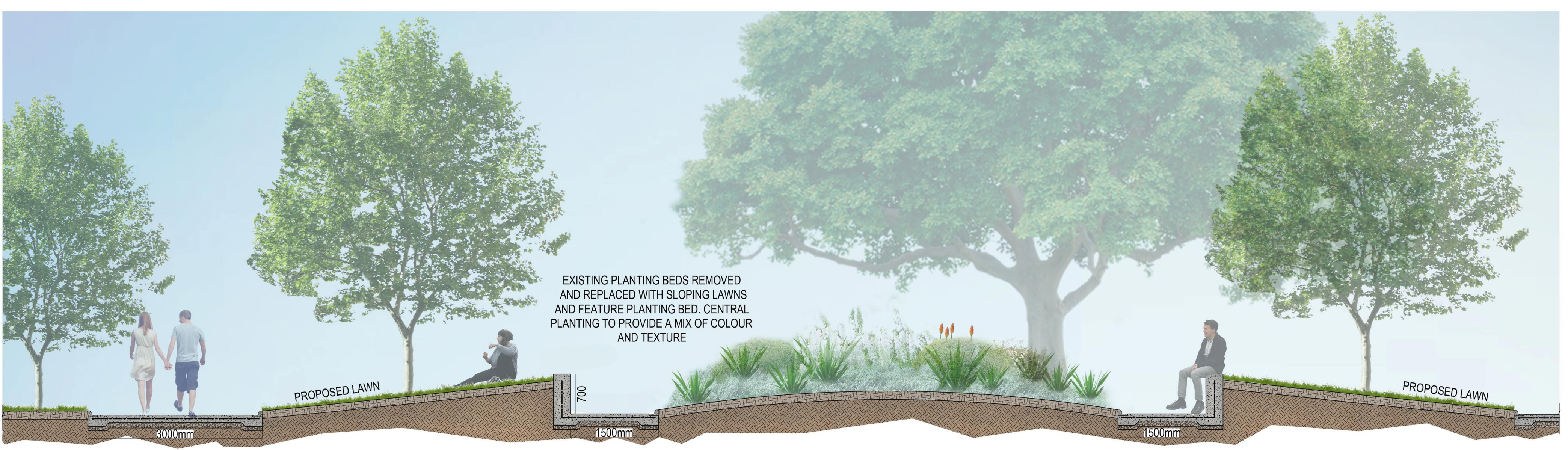
1 Northern Feature Planting/Lawn Section 1 1:50 @ A1