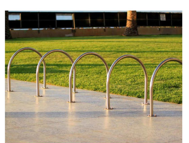
Bike Hoops to be Installed: Commercial Systems Australia- BR7008