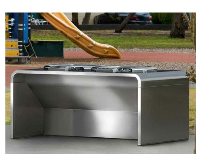
Proposed - Christie - A Series - Wheelchair Accessible Public Barbecues BBQ

PATHS REALIGNED TO PROVIDE SYMMETRY OF LAYOUT AND TO FOCUS ON NEW CENTRAL PLANTING AREAS