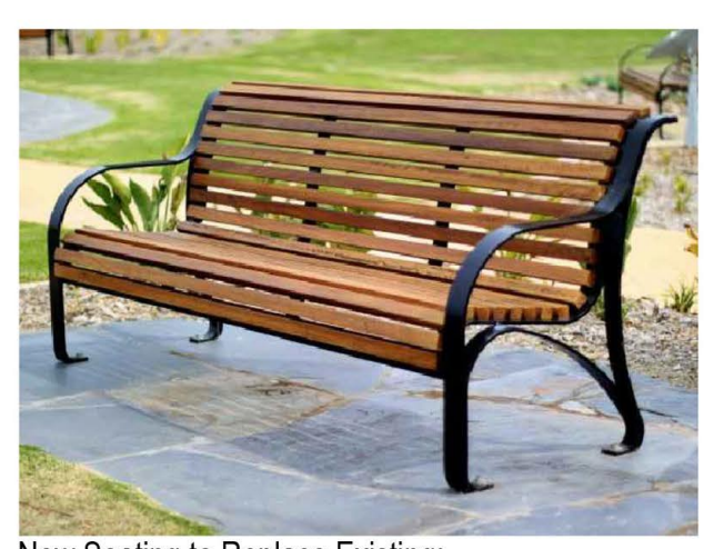
New Seating to Replace Existing: Commercial Systems Australia- TM4064

PROPOSED NEW BICYCLE HOOP PARKING CITY OF GLEN EIRA PLINTH EDGE TO BE USED AT ALL PARK EDGES TO PREVENT VEHICLES INTRUSION AND PROVIDE CONSISTENT TREATMENT EXISTING PLANTING BEDS REMOVED AND REPLACED WITH SLOPING LAWNS AND FEATURE PLANTING BED. CENTRAL PLANTING TO PROVIDE A MIX OF COLOUR AND TEXTURE EXISTING CONCRETE PAD TO BE REMOVED EXISTING TREES TO BE RETAINED WITHIN MULCHED GROUND SURFACE EXISTING TABLE REMOVED AND REPLACED WITH NEW SEATS EXISTING TABLE REMOVED AND REPLACED WITH NEW SEATS PROPOSED PATH TO FOLLOW EXISTING ALIGNMENT NEW PLANTING BED AT INTERSECTION TO REFLECT NEW PLANTING IN NORTHERN FEATURE AREA FEATURE PLANTING TO REFLECT COLOUR AND TEXTURE OF NORTHERN AND CENTRAL GARDENS PROVIDING A THEMATIC VISUAL LINK ALONG THE MAIN PATH SYSTEM BANDSTAND TO BE RECONSTRUCTED IN THE CURRENT LOCATION AND IN SIMILAR FORM TO EXISTING, LOWERED TO PROVIDED ACCESS AT GROUND LEVEL LAWN AREA TO BE RETAINED WITH ADDITIONAL PICNIC TABLES TO ENCOURAGE COMMUNITY ACTIVITIES NEW BARBECUES PROVIDED ADJACENT TO UPGRADED PLAYGROUND PLAYGROUND RE-DEFINED WITH NEW PATH EDGE AND UPGRADED WITH NEW EQUIPMENT (INDICATIVE ONLY) EXISTING BLUESTONE SEAT TO BE RETAINED PROPOSED NEW BICYCLE HOOP PARKING