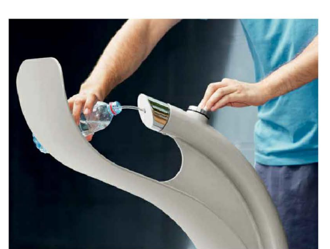
Replace Existing Drinking Fountains with dog bubbler: Street Furniture Australia - DF4-DB