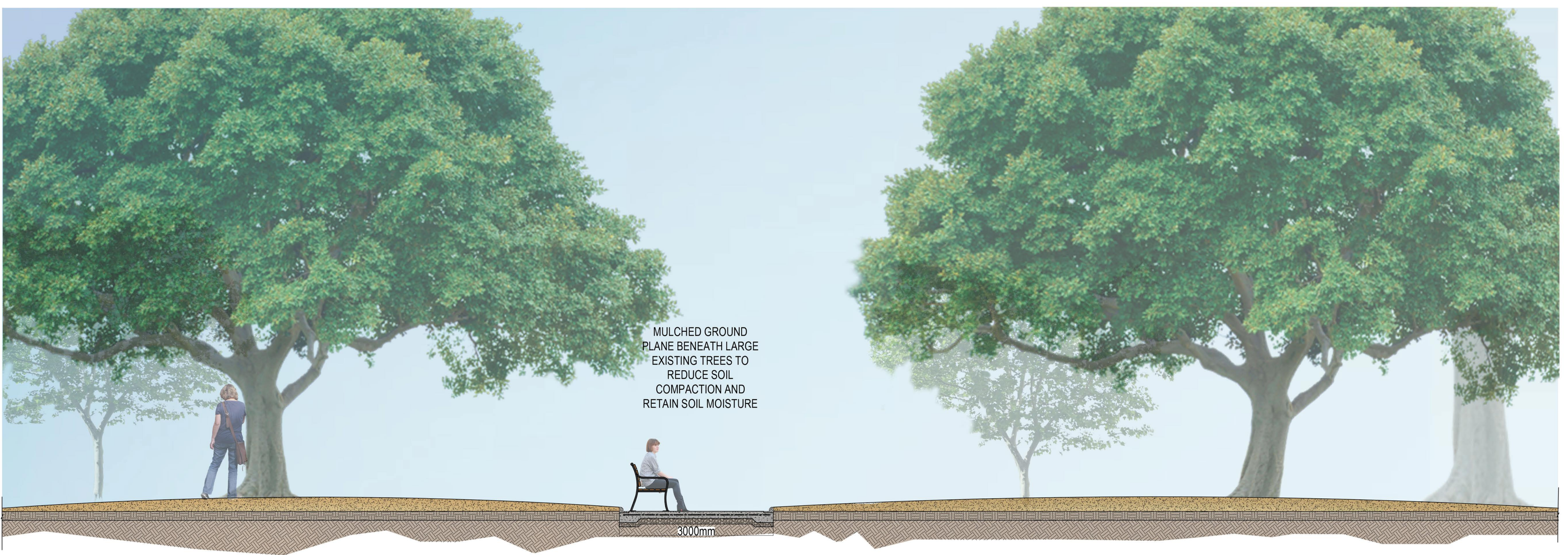
2 New Garden Bed Section 2 1:50 @ A1